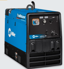
Welder/Generator 907753 $5,961 MSP