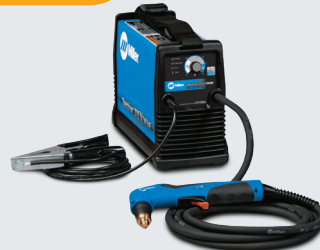
Plasma Cutter 907529 $1,495 MSP