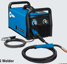
MIG Welder 907612 $875 MSP