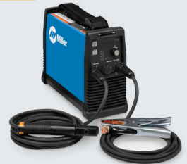
TIG/Stick Welder 907710 $1,315 MSP