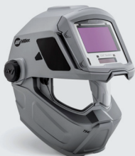
260483 $535 MSP