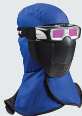
267370 $209 MSP