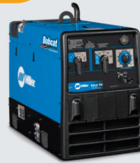
Welder/Generator 90750001 $4,805 MSP