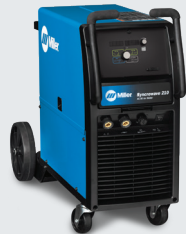
TIG/Stick Welder 907596 (without spool gun) $2,645 MSP