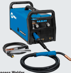
Multiprocess Welder 907693 $1,615 MSP