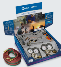
MBA-30510 $529 MSP

2 MORE SAVINGS when you add on Miller accessories* or Hobart® filler metals.