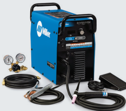
TIG Welder 907627 $2,289 MSP